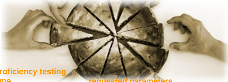
proficiency testing type